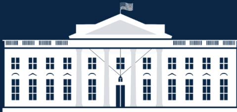
THE WHITE HOUSE